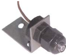
150062 & 836068 micro Thru-Fitting & MB-2 Mounting Bracket plastic fitting with lock nut, sealing nut, and hub 1.17" x 0.59" (29.7 x 14.99 mm) PG-7 thread