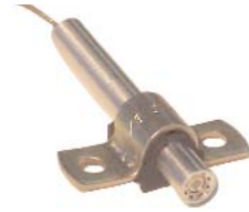
150065 APJ-1 Omega clamp metal clamp with rubber cushion for mounting 1.81" x 0.78" (45.97 x 19.81 mm)