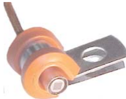
150037 MB-5 micro clamp mounting bracket Stainless Steel, with silicone cushions 0.25" diameter