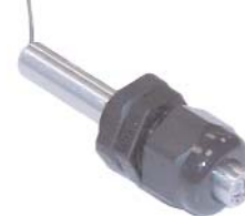
150063 APJ-1 Thru-Fitting plastic fitting with lock nut, sealing nut and hub 1.17" x 0.59" (29.7 x 14.99 mm) PG-7 thread

Increasing your production throughput, at an affordable cost