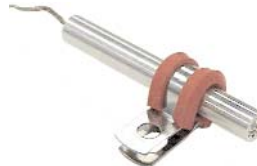
150038 MB-4 APJ-1 clamp mounting bracket Stainless Steel, with silicone cushions 0.38" diameter