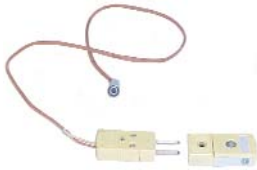
108000 IRt/c connector kit type K thermocouple connectors