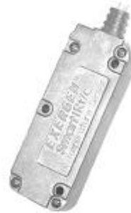
SmartIRt/c.3 (3:1 FOV) & SmartIRt/c.5 (5:1 FOV)

3.71" x 1.37" x 0.76" (94.3 x 34.9 x 19.4 mm)