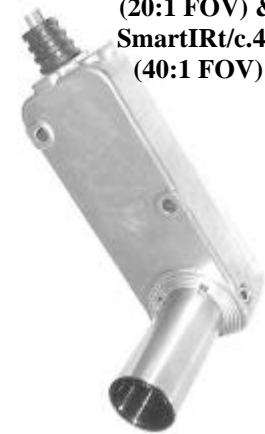
SmartIRt/c.20 (20:1 FOV) & SmartIRt/c.40 (40:1 FOV)

3.71" x 1.37" x 0.76" (94.3 x 34.9 x 19.4 mm)